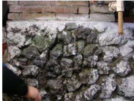
Heavy efflorescence and also alga growth.