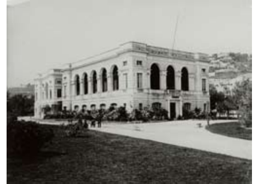
Stazione Zoologica ca. 1870