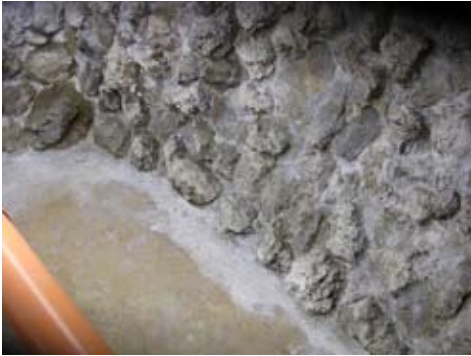
The aquarium background wall exposed after water is removed.