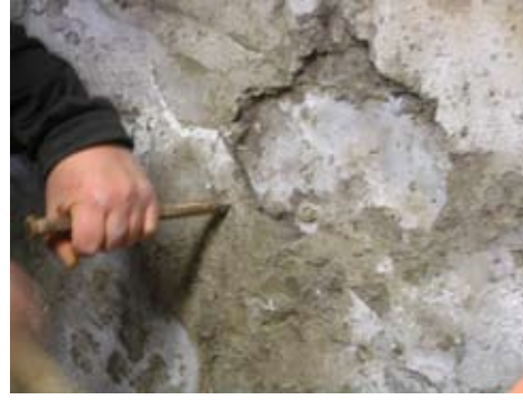
Removing render to examin underlying concrete.