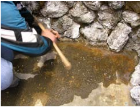
Chiseling out the wall/floor junction.